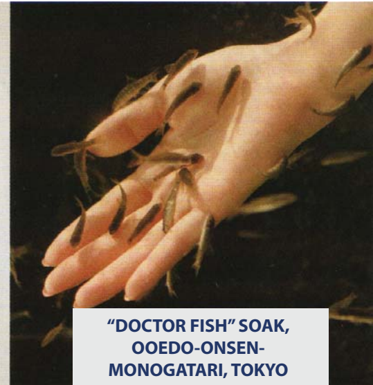
"DOCTOR FISH" SOAK, OEDO-ONSEN-MONOGATARI, TOKYO

Who would get this: Avian-flu naysayers.