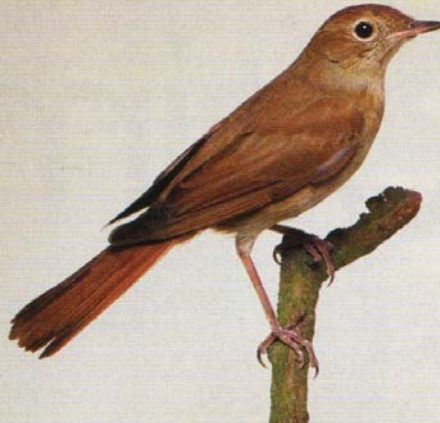
NIGHTINGALE-DROPPING FACIAL, THE DIAMOND HAWAII RESORT & SPA, MAUI

Who would get this: Werewolves with a lot of time on their hands.