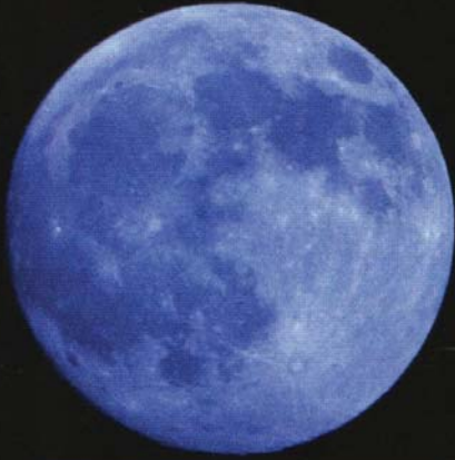
IZUMI LUNAR PHASE TREATMENT, THE HYATT REGENCY, GORA, JAPAN

If beauty is in the eye of the beholder, it follows that relaxation would also be a relative thing. As it turns out, one woman's worst nightmare (snakes!) is another's inventive alternative to shiatsu. Below, we take a look at some of the most creative—and just plain crazy—treatments that spas the world over have to offer. By Danielle Pergament