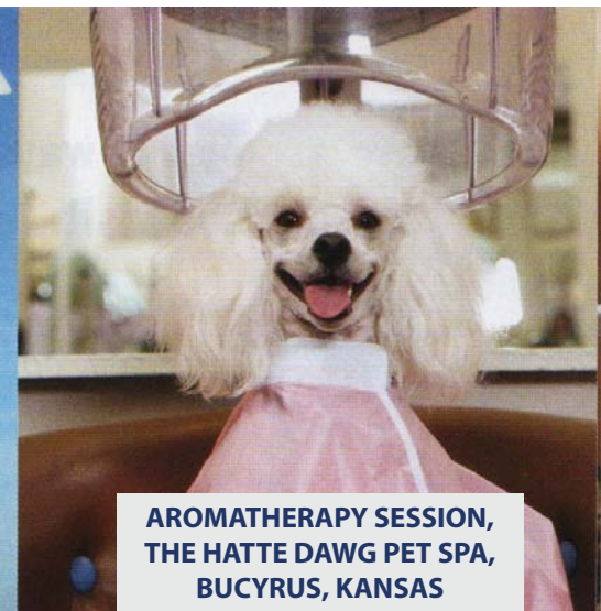
AROMATHERAPY SESSION, THE HATTE DAWG PET SPA, BUCYRUS, KANSAS

Who would do this: People who forget where their face is.